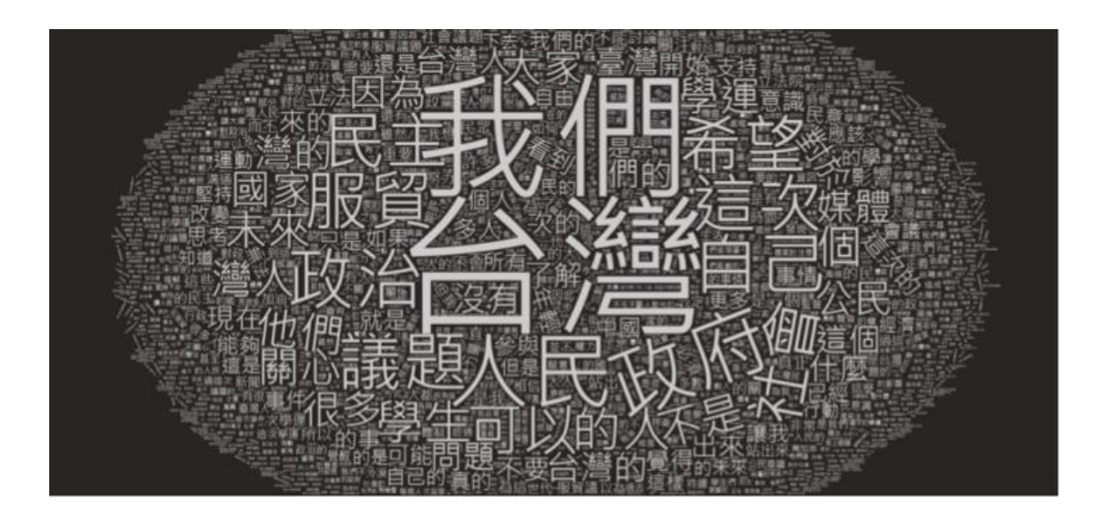
Figure 6: We, Taiwan

The core tenets held by the social movement group was largely exemplified by these thoughts. The younger generation making up the leaders and participants in this society believed they could protect Taiwan's democracy in standing up to the muddleheaded government and save this imperiled country.